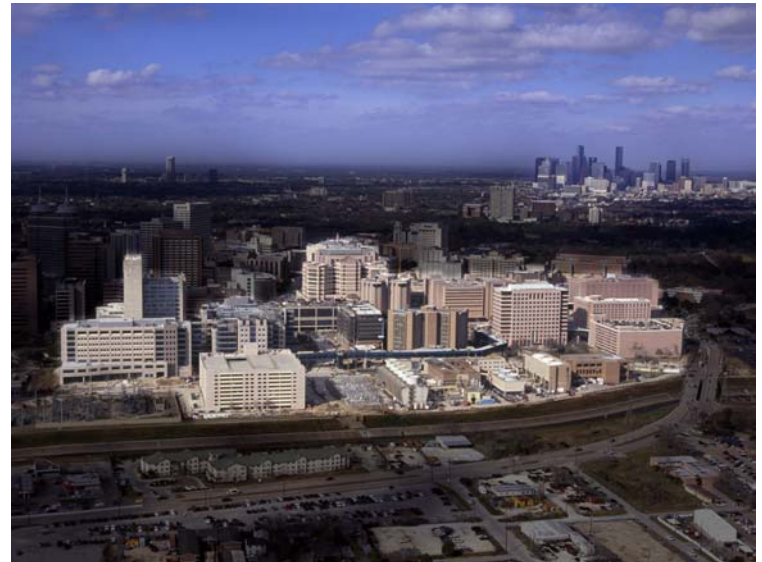
The University of Texas M. D. Anderson Cancer Center campus, located in the Texas Medical Center

You are invited to attend the Gulf Coast Medical Writing and Communication Conference, sponsored by the Southwest Chapter of the American Medical Writers Association and the Department of Scientific Publications at The University of Texas M. D. Anderson Cancer Center. This event will be held at the Hickey Auditorium & Conference Center, located on the 11th floor of the R. Lee Clark Clinic Building at M. D. Anderson